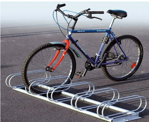
Bicycle docking stand at Hyderabad

The approximate expense for 100 cycle can be as below