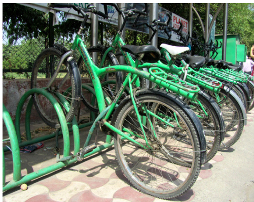
A bicycle dock at IISC Bangalore